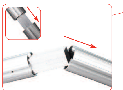
Align and slide female post over male post.

To attach the stand off's, place the rail fixing into the channel on the linear post and twist the bottom section off the stand off until securely in place. Place the graphic into place within the stand off and tighten grub screw until tightly in place.